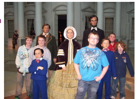
Students pose with the Lincoln Family.