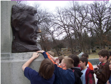
Students try to rub Lincoln's nose for good luck.

The Spring Sing will be on April 19th, in the High School Auditorium. Students should arrive by 6:40pm. Choir students should arrive by 6:20 pm in order to run through their music with the accompanist. Classes will sing in age order, 3rd, 4th, 4/5 choir, then 5th.